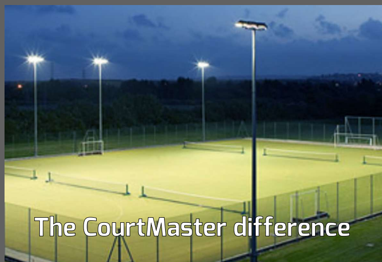
The CourtMaster difference