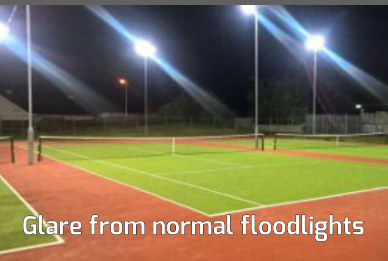
Glare from normal floodlights

Contact us for an obligation-free discussion to learn how we can upgrade your existing tennis court lighting, or create a lighting design for a new court. Call us for initial guidance and order conveniently through the electrical wholesaler network across Australia.